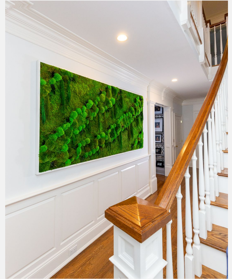
New Canaan, CT