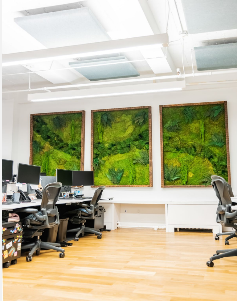
Mimeo New York, NY