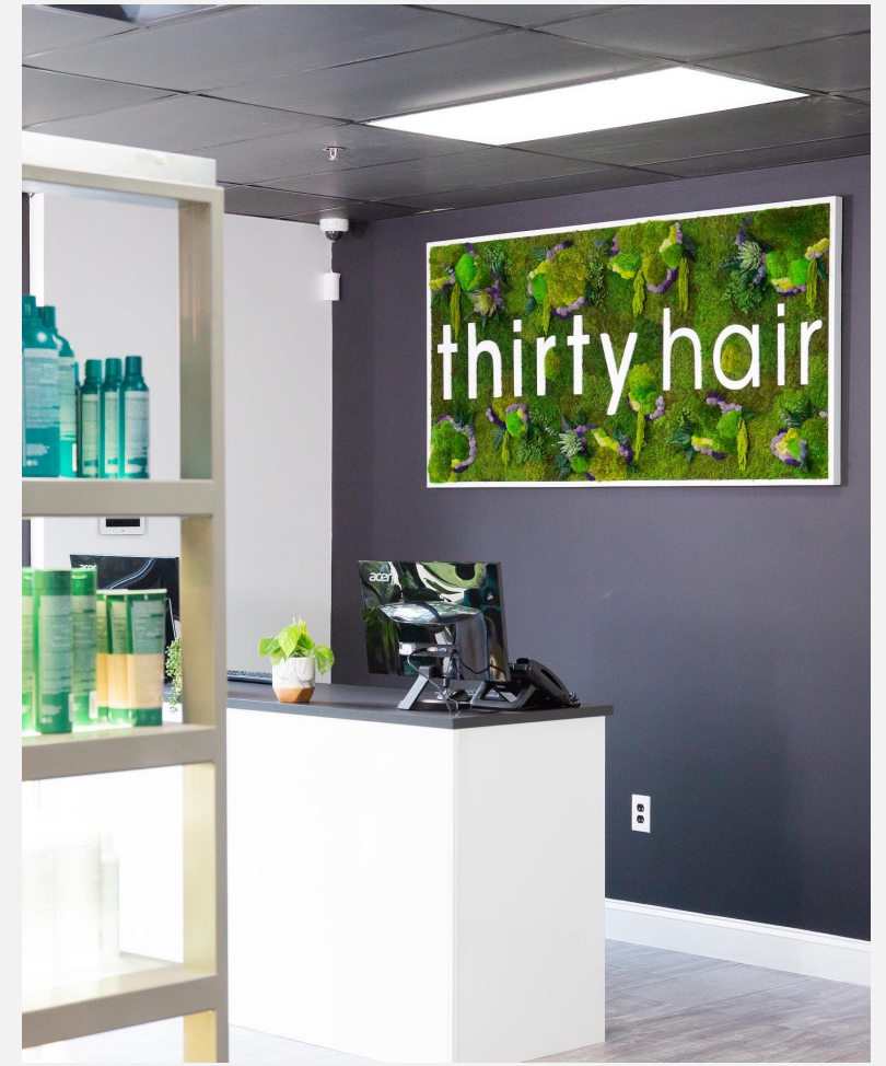
Thirty Hair Columbia, MD