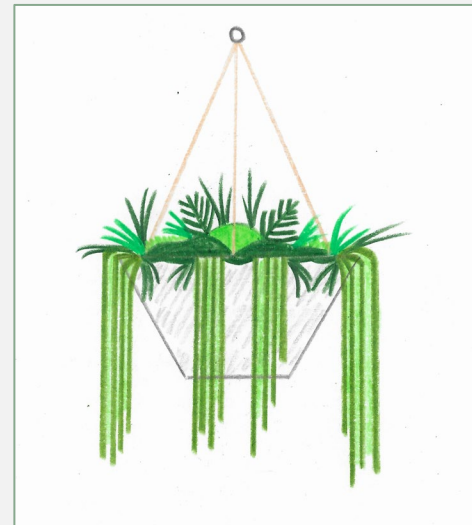
Project Concept Sketch

One or more hand drawn concept sketches based on initial Project Discussion.