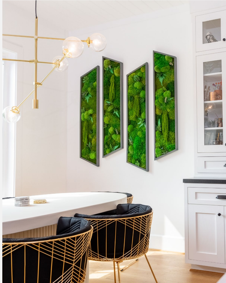
Valley Village, CA