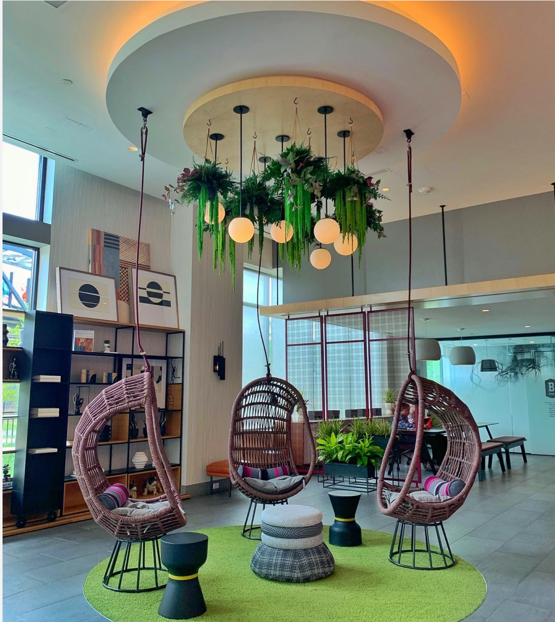
Amaranthus Chandelier in lobby of Bryant St NE in Washington, D.C.