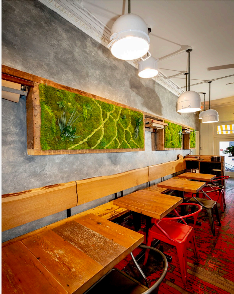
Pure Sweets & Co. Philadelphia, PA

To browse the full Kate the Earthling portfolio please visit www.katetheearthling.com/custom-commissions